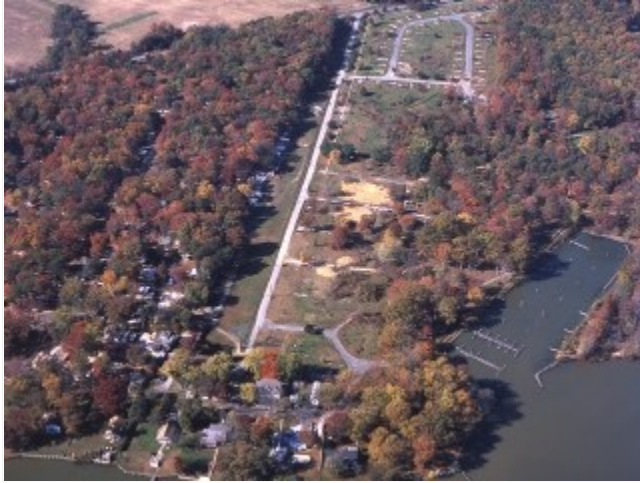
Chestnut Point former Marina and Campground

Chestnut Point Rd & Carpenters Point Rd, Perryville, MD 21903